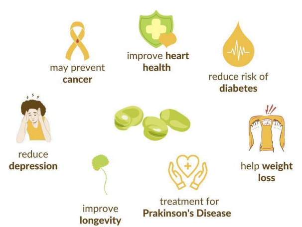
The consumption of pulses provides a variety of health benefits

Research shows that a regular - preferable daily - consumption of pulses provides a variety of health benefits, from reducing the risk as well as aid in management of many chronic diseases.