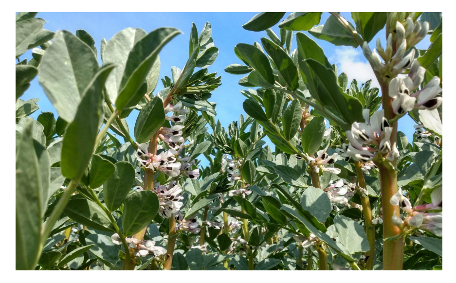
Faba bean (Vicia faba) in the flowering phase.